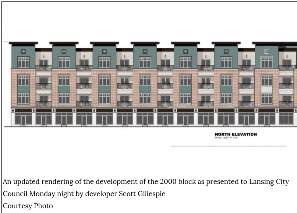
An updated rendering of the development of the 2000 block as presented to Lansing City Council Monday night by developer Scott Gillespie

BY TODD HEYWOOD ( HTTP://LANSINGCITYPULSE.COM/BY-AUTHOR-152-1.HTML )