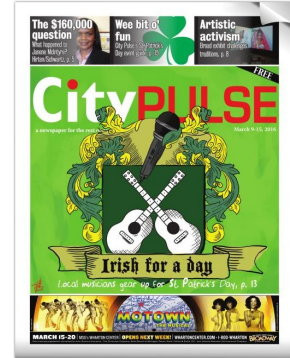
( http://npaper-wehaa.com/citypulse )

Click Here to Read This Week's Paper ( http://npaper-wehaa.com/citypulse )