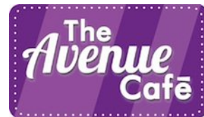
( http://clicking.wehaaserver.com/?keyplane=VugIfwAD5uGuL4itqe49YT9Y7p4ZY5kPvYmQ28t%2F%2 )