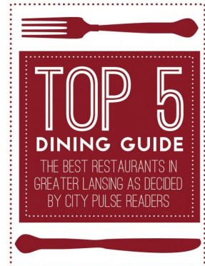
( flex-187-topfive.html )

NEWS ( HTTP://LANSINGCITYPULSE.COM/233-1-NEWS.HTML ) 5 ) UPDATE: 'Tower of Terror' ( http://lansingcitypulse.com/12825-UPDATE-Tower-of-Terror.html )